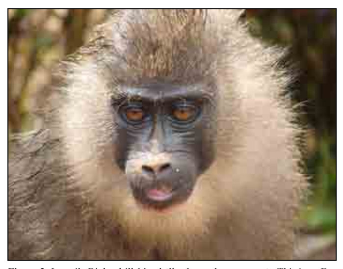
Figure 3. Juvenile Bioko drill Mandrillus leucophaeus poensis . This is an Endangered species (IUCN 2009) which is represented on Bioko Island, Equatorial Guinea by this endemic subspecies. This is the preferred prey of the commercial bushmeat hunters on Bioko. The total number of drills on Bioko as of 2009 is unlikely to be more than 4,000. A photograph of an adult male Bioko drill appears on the front cover of this issue of Primate Conservation .

Unfortunately, red colobus and black colobus Colobus satanas are usually eviscerated by hunters soon after being shot. For these two species the weights of the eviscerated