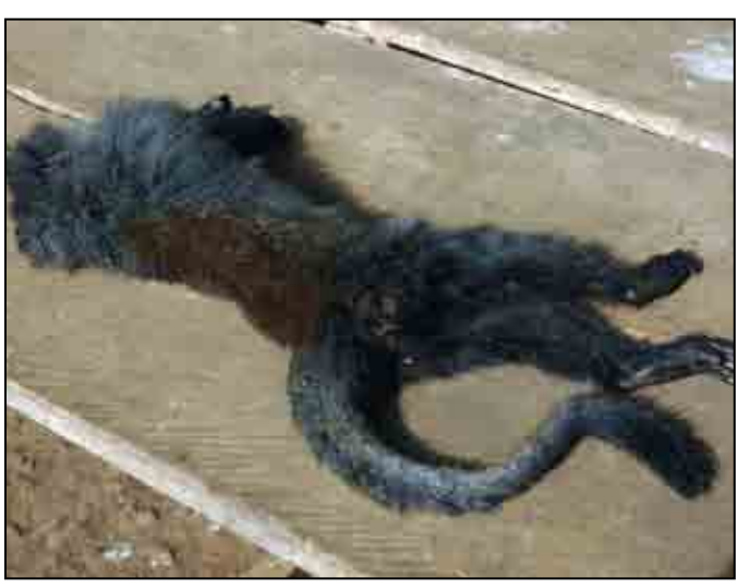
Figure 4. Bioko Preuss's monkey Allochrocebus preussi insularis for sale at the Malabo ('Semu') Bushmeat Market, Bioko Island, Equatorial Guinea. This is an Endangered species (IUCN 2009) which is represented on Bioko by an endemic subspecies. Note the short tail which is characteristic of this subspecies. All five of Bioko's threatened species of monkey are sold at this market. No fewer than 2,940 monkeys were sold here during the first 6 months of 2009.