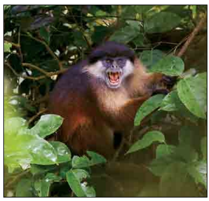
Figure 2. Adult male Bioko red colobus Procolobus pennantii pennantii . This is a Critically Endangered species (IUCN 2009) and one of five threatened species of monkey on Bioko Island, Equatorial Guinea. This subspecies is limited to the southern-western corner ( ca. 20%) of Bioko Island.